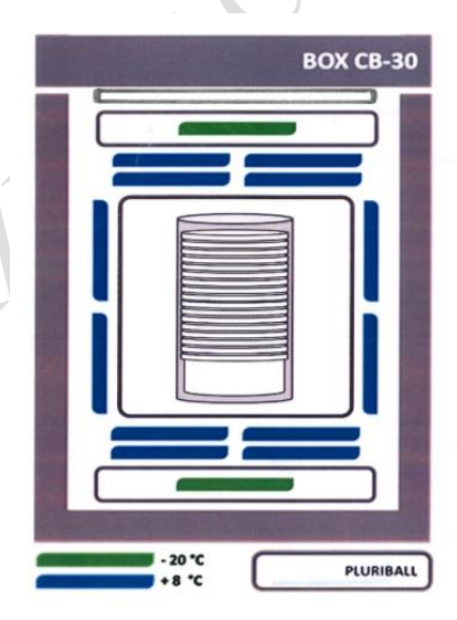
Figure 2. Scheme of the adult mosquito shipment packaging.

Usually, the mosquitoes are delivered within 24 hours from CAA facility to the release areas. The temperature and humidity are recorded by means of a data logger placed inside the package (Figure 2).