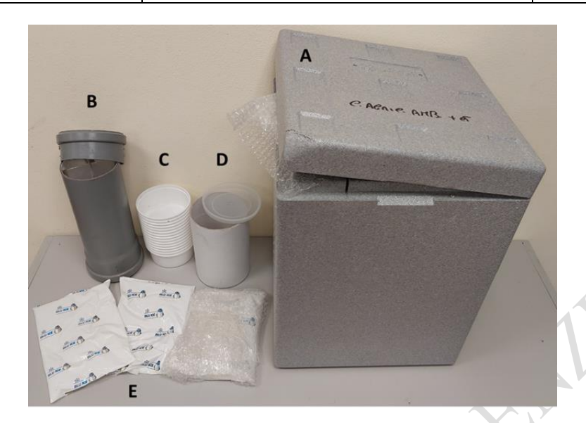
Fig. 1 – A) Polystyrene container; B) emerging tube (max. 2200 pupae); C) plastic cups for the adults; D) cardboard cylinder to hold cups; E) PCM gel packs (Blue Ice and Green Ice to maintain cooling during the transport of Aedes albopictus males.

Usually, the mosquitoes are delivered within 24 hours from CAA facility to the release areas. The temperature and humidity are recorded by means of a data logger placed inside the package (Figure 2).